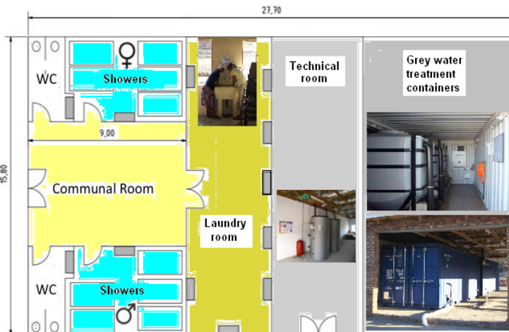
CWH general layout of CWH demonstration unit in Jansenville